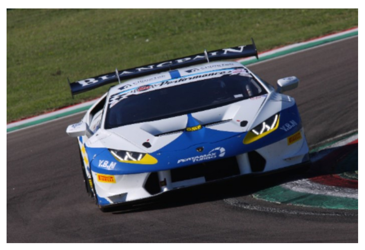
Baruch and Liang suffered a disappointing DNF in race one after looking set for a podium and finished 5th in race two

nament with a decisive move exiting the parabolica. In the remaining minutes he pulled out a substantial gap and took the win by 14 seconds.