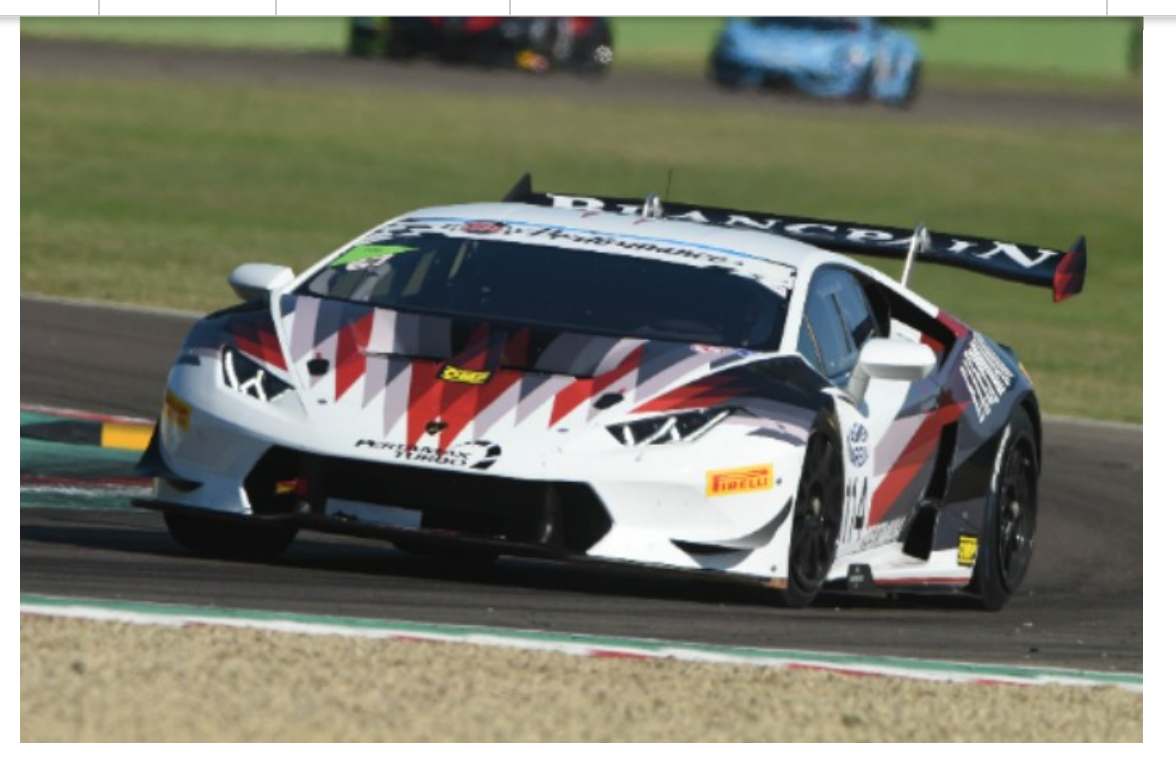
Krenzia raced alone at Imola and after qualifying 4th for race two challenged for a podium on Saturday

In Q2 Costa completed a clean sweep for the 106 VSR Lamborghini, taking an accomplished pole position with a lap-time that was over one second clear of the rest of the field including Zaugg in 2nd place. Krenzia finished the session an impressive 4th fastest and Liang qualified just behind him on row three.